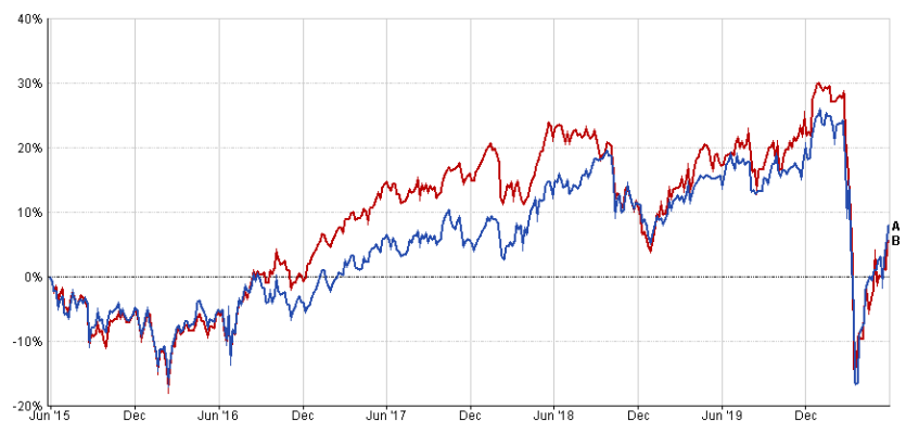
A - Castlefield B.E.S.T Sustainable UK Opportunities General [8.14%] B - IA UK All Companies [5.73%]

Pricing Spread: Bid-Bid • Data Frequency: Monthly • Currency: Pounds Sterling